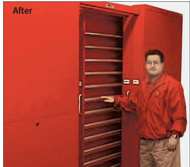
Each BYO Gemtrac stores 4,128 DV Cams or 2,376 VHS & 336 large beta.

Interior shelves adjust in 1/2" increments to adapt to future, smaller tape sizes. Backstops orient tapes to the front of each shelf, making them easy, visually and physically, to access. A 1/4" lip at the front of each shelf keeps tapes from falling forward, and bookend supports retain the tapes on unfilled rows.